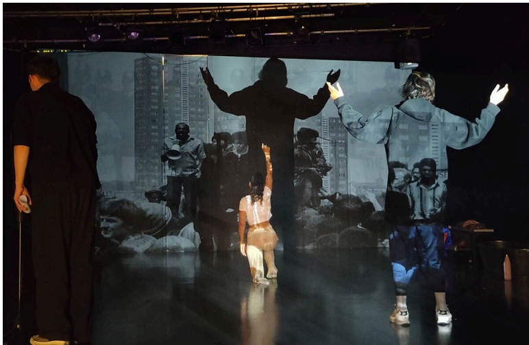
A previous production from the Cardiff- and Bradford-based theatre company Common/Wealth, who are creating the spycop show Demand the Impossible

A world premiere immersive production will investigate how undercover police infiltrated and duped hundreds of political groups in the past 50 years.